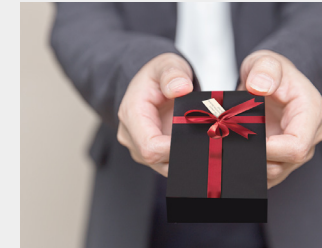
... as an employee gift