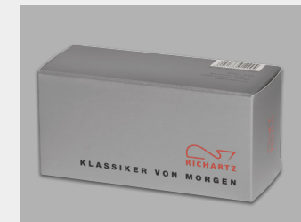
... with standard packaging