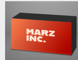
... as campaign supporter