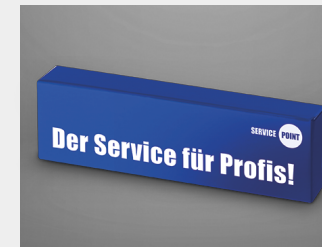
... as campaign supporter