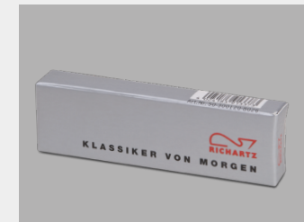
... with standard packaging