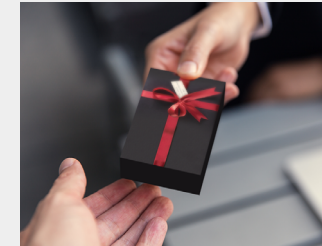
... as an employee gift