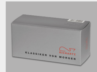
... with standard packaging