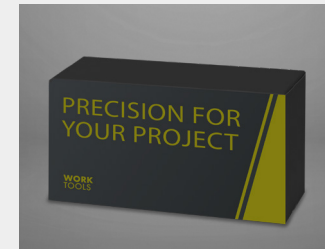
... as campaign supporter