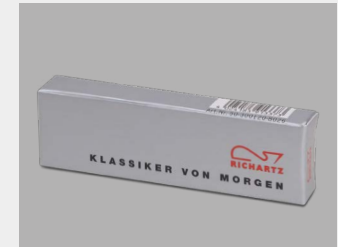
... with standard packaging