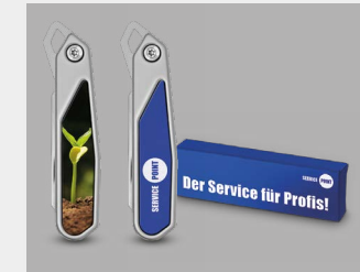
... as campaign supporter