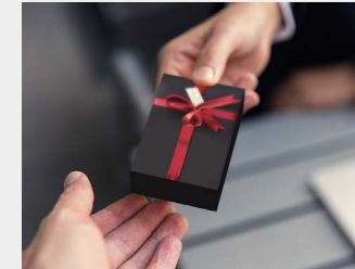
... as an employee gift