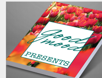
... as campaign supporter