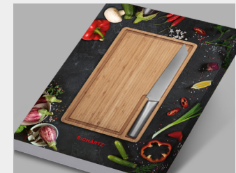
... with standard packaging