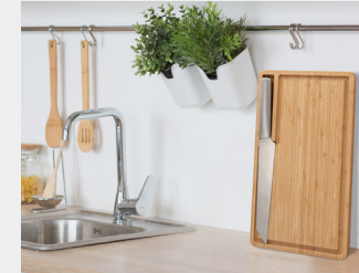
... to always be present